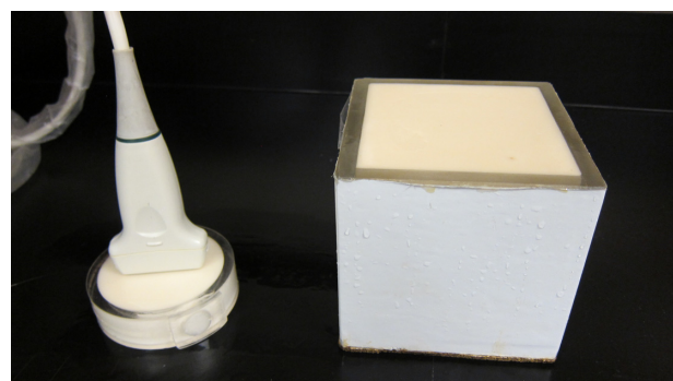
FIG. 1. (Color online) Data collection set-up. The sample was scanned first and the reference was imaged under the same system settings used for the sample.

(1) Bias with respect to the Faran results ( B_{Faran} ): This is defined as the relative error of \sigma_{sam} with respect to the prediction from Faran theory ( \sigma_{Faran} ). This is expressed as